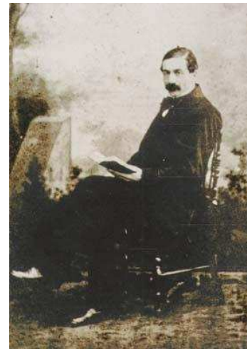
Faa di Bruno: roots of multivar. algebraic equations