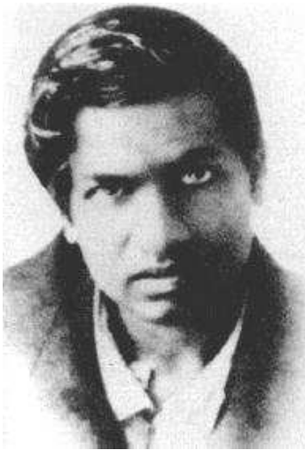
Ramanujan: integer sums

Determined by : • Index Structure • Multiplication Relation